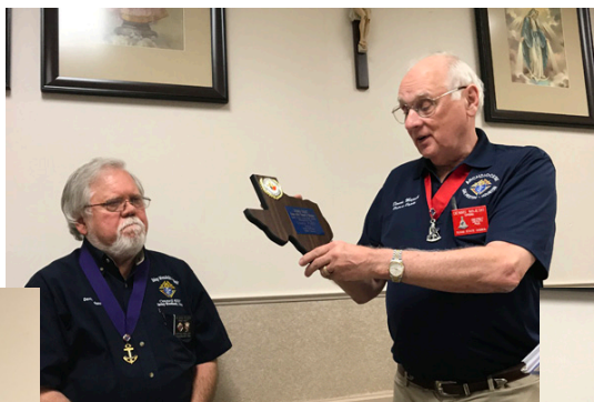
Worthy Grand Knight Accepting several awards at the Business Meeting. Among them: 15 Years of Exceeding our Charity Goal