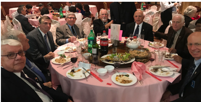
Council 6557 at the Dinner to meet the Chinese priest, fund raiser to help defray the costs of bringing clergy from China to study in the United States.

Be sure to invite people out to see us, and when you get a chance to speak to a Catholic gentleman show them what we do! What you do is really pretty awesome - TELL SOMEBODY!